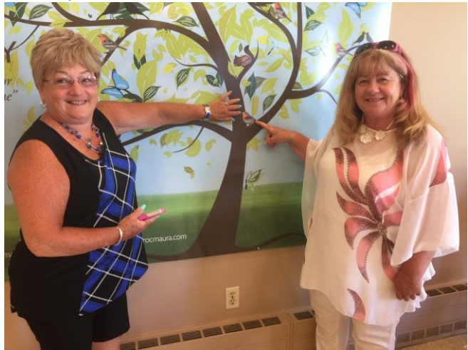
“It is so nice to have the memorial tree. Mom would have loved that because she loved birds and nature.”